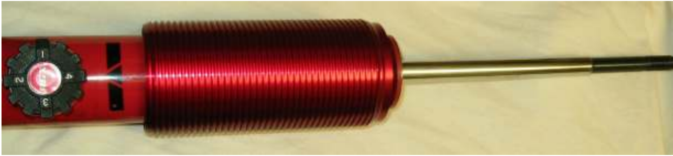
99-05 (NB) KYB sleeve assembled