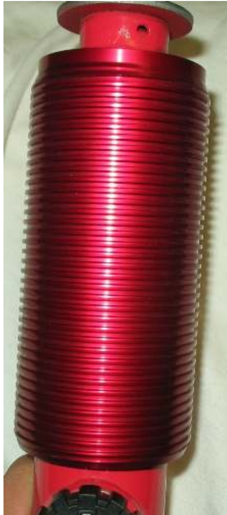
90-97 (NA) KYB sleeve assembled